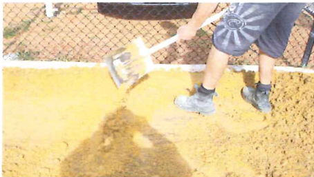
Scrape the area flat with a shovel.

STEP 1 - Clear your site: Clear the area to be paved and remove any plants and roots.