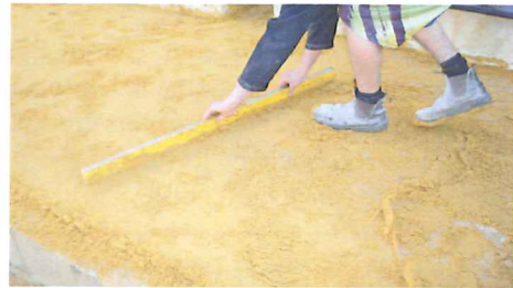
For best result use a long straight float to screed the sand and level it.

STEP 2 - Add your bedding layer: Spread a layer of "Paving or Bricks" sand at a thickness of around 40mm. Rake the sand around the area to achieve even level of distribution.